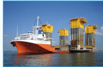
Marine Deep Driller