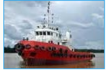
Towing Tug - Spares

NAFA OFFSHORE in supplying products relating to all aspects of the offshore industry from exploration drilling via supply and sub sea installations to operations and extraction. Lifting, mooring and maritime equipment are among our core products.