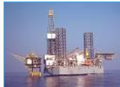
Equipments for Offshore Oil Plat Form