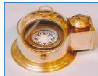
Marine Magnetic compass