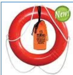
Life Saving Ring