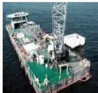
Spares for Crane Barge