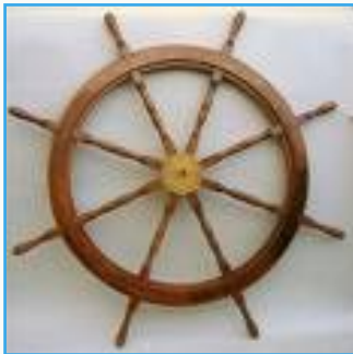
Wheel House Steering