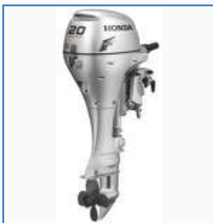
Out Board Engine