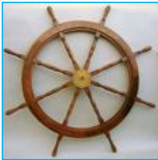
Wheel House Steering