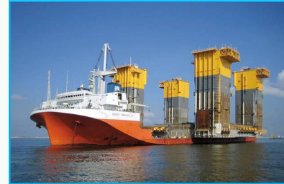
Marine Deep Driller