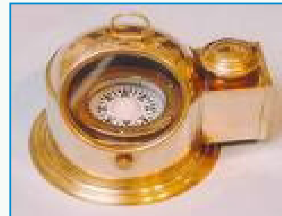
Marine Magnetic compass