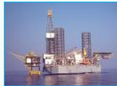
Equipments for Offshore Oil Plat Form