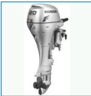
Out Board Engine