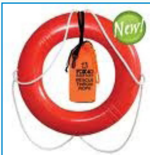
Life Saving Ring