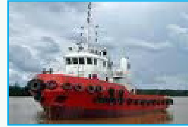
Towing Tug - Spares

NAFA OFFSHORE in supplying products relating to all aspects of the offshore industry from exploration drilling via supply and sub sea installations to operations and extraction. Lifting, mooring and maritime equipment are among our core products.