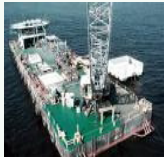
Spares for Crane Barge